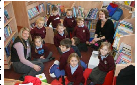
Children for St Mary's in the Story Corner