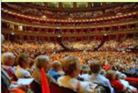
The WI AGM at the Albert Hall

As we welcome in the New Year, looking forward to some new and exciting times in the WI, our thoughts also turn to look back at what we did in 2009. It is always a busy year in the WI Nationally and there is plenty of choice for women to get involved as little or as much as they want. 2009 has been no exception and with the Shropshire Federation of WIs celebrating its 90 th birthday, many brilliant events were organised. The 90 th Anniversary Annual Council meeting in April was held at the new Shrewsbury Theatre Severn which was 'packed' with women. I, for one, as a new member of WI found it awe inspiring, the atmosphere electric, as were the guest speakers.