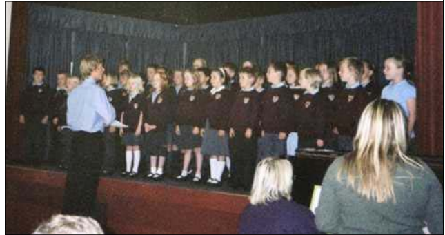
St Mary's School Choir entertains at the Harvest Supper