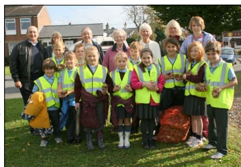
Pupils from St. Mary's, Community Councillors & residents of Parkside

Children from the school have also visited Chirk Castle in October to spend a day finding out what it was like to live there in Tudor times.