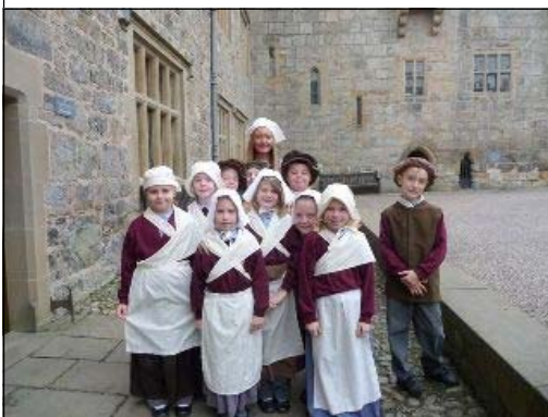
Pupils from St. Mary's during a school visit to Chirk Castle

Overton will look forward to a host of golden daffodils in the Spring. The Community Council has acquired 100 kilos of daffodil bulbs. Children from St Mary's School helped Community Councillors plant some of them around Parkside. They will plant more around the school.