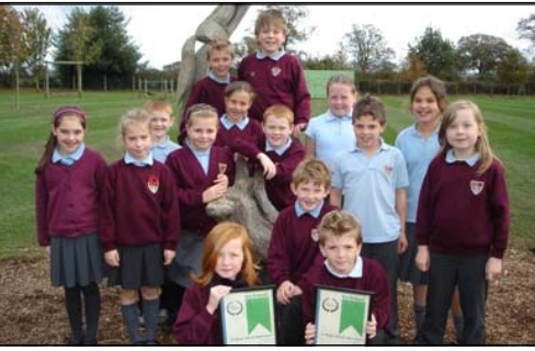
The school's Eco-council with their awards

The children found out exactly how much electricity and water we use and sometimes waste and have worked with our caretaker to plan ways to save energy too. We have had many successes so far this year, including a new pond development and our latest news is that we have gained our bronze and silver eco-school status in Oc-