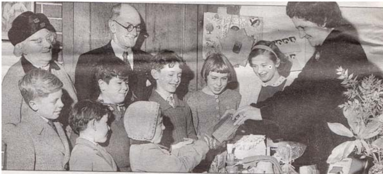
At the Overton Methodist Church Christmas fair.