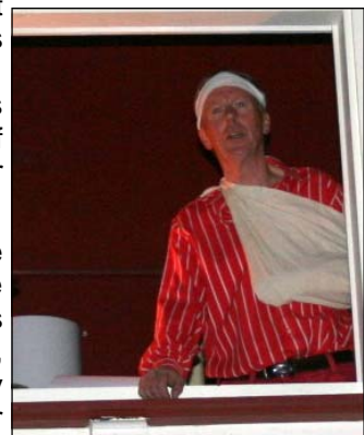
He’s behind you!