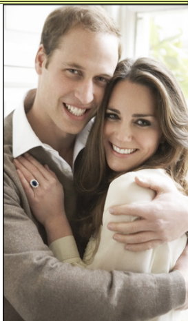
The official engagement photograph of Prince William and Catherine Middleton.

On Friday the 29 th of April the United Kingdom will be celebrating the marriage of Prince William and Kate Middleton. As Overton has been known in the past as a village that really knows how to party, we thought that it would be a great idea to bring the village together to celebrate their special day. The concept of a street party would enable and create a day of fun to remember for all ages.