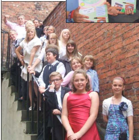
← Year 6 leaving party at the White Horse