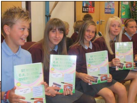
↑ Year 6 with their Records of Achievement

Year 6 pupils at St Mary's school had a very busy last week in primary school. As well as taking part in the grand opening of the historical gardens they also had a leaving service in school where they were presented with their souvenir leaving books courtesy of the P.T.A.. Then to cap it all off they donned their glad rags for a World War II themed leaving party at the White Horse, again organised superbly by the P.T.A. assisted by members of staff.