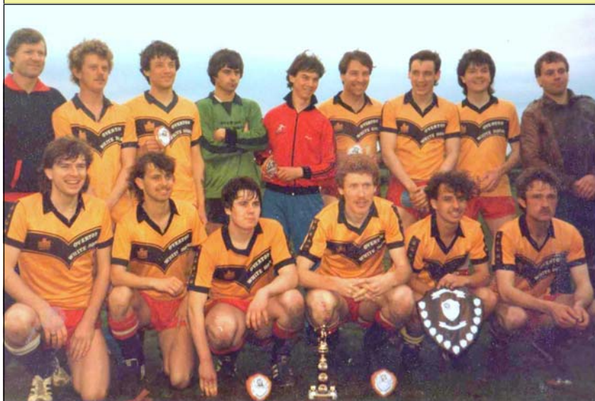
Overton Athletic with the Nth Wales Shield & Shropshire Knockout Cup